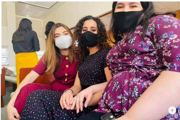
A trio of young women gather for worship at the newly formed Politecnico Young Single Adult Ward in Mexico City. The ward is believed to be the first YSA unit in Latin America.