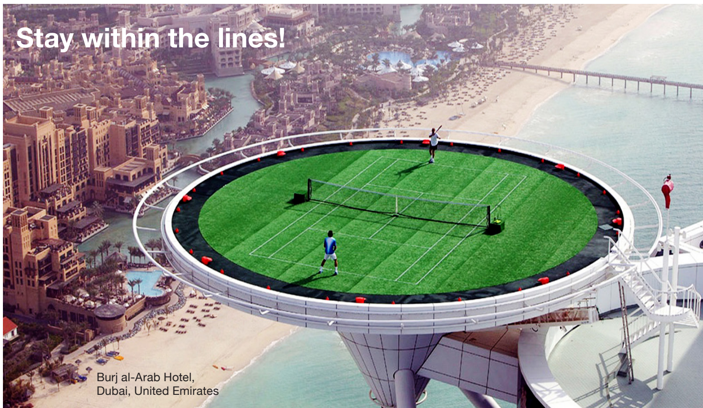
Burj al-Arab Hotel, Dubai, United Emirates